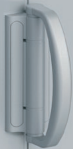
Twin bolt lever